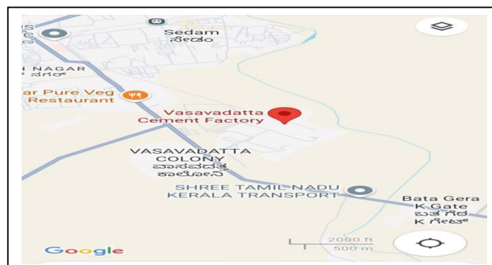
Fig No:3 Represents the Industrial Area (Sedam)

Sedam has a growing industrial sector, primarily focused on cement production, textiles, and agro-based industries. Key industrial areas include :- Vasavadatta cement factory.