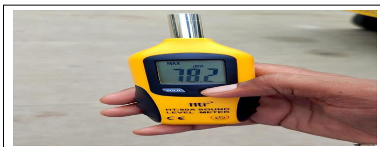
Fig.No.6 Monitoring of Noise level in Commercial Area

After Identifying different locations in Sedam Taluka. And the readings are taken in Market area and Bus stand as considering Commercial Area (R.A) in morning, afternoon and evening hours. We have observed the readings from the table which varies from day 1 to day 7. The noise level by taking into account of morning, afternoon & evening hours considering of Commercial area, Industrial area and Silence zone. The minimum noise level at Commercial area is 67.11dB and the maximum noise level is 85.28dB and the average is 77.23dB and at the Industrial area the minimum noise level is 60.2 dB and the maximum noise level is 89.6dB and the average is 71.64dB and at Silence Zone the minimum noise level is 62.3 dB, the maximum level is 71.7dB and the average is 67dB. which is more than the limits compared to CPCB Standards. Result shows, the noise should be identified as the major environmental problem and should take necessary steps to minimize it.