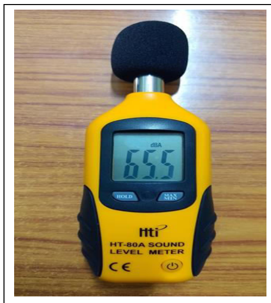
Fig No:5 Represents the Decibel meter

To monitor the sound pollution, we used an instrument which is known as Decibel meter or meter for Sound Level.