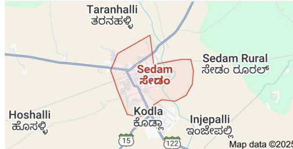
Fig.No:1 Represents the location of Sedam Taluka