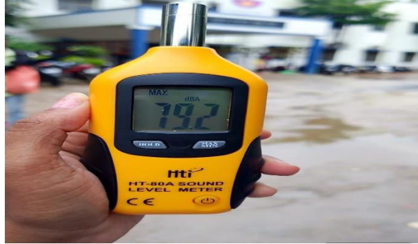
Fig.No.7 Monitoring of Noise level in Silence Zone